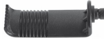
Lateral Blade (Peek 23 mm)