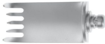
Medial Blade (23 mm)