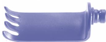
Medial Blade (Titanium 20 mm)