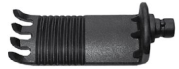
Medial Blade (Peek 23 mm)