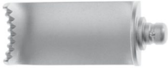
Lateral Blade (23 mm)