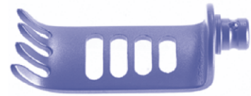
Medial Blade (Titanium 20 mm, Fenestrated)