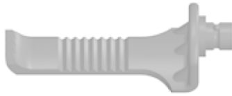
Extra Thin Lateral Blades (15 mm)