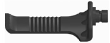
Extra Thin Lateral Blades (12 mm, Peek)