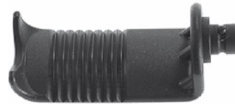
Blunt Blade (Peek 23 mm)