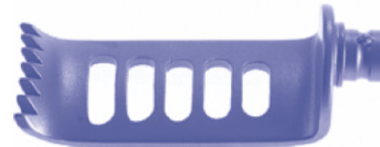
Medial Blade (Titanium 20 mm, Fenestrated)