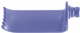
Lateral Blade (Titanium 20 mm)